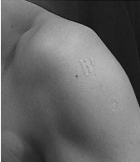
Figure 2 Application of a glyceryl trinitrate (GTN) patch to the shoulder for supraspinatus tendinosis.

In our rat model, we delivered NO via flurbiprofen, a non-specific cyclo-oxygenase inhibitor and via NO-paracetamol. In both experiments, the addition of NO had a protective or beneficial effect on collagen organisation, tendon healing failure load and stress (load/area). 16 17 These rat results are consistent with cell culture findings for human tendon cells