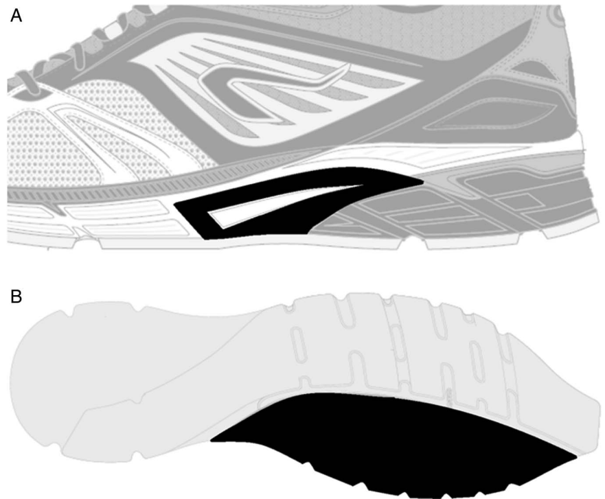
Figure 1 Illustration of the two technical features (coloured in black for illustration purposes) designed to limit the pronation movement of the runners. (A) Represents a piece of rigid plastic (thermoplastic polyurethane) located on the medial side, under the midfoot at the midsole edge. (B) Area of the harder midsole EVA (ethylene-vinyl acetate) foam. These elements were not recognisable on the shoe version distributed.

model within each strata. Significance was accepted for p < 0.05 . All analyses were performed using SPSS V.20.