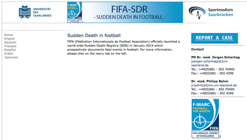
Figure 1 Starting internet-page of the FIFA Sudden Death Registry (FIFA-SDR) at http://www.sudden-death-in-football.com . By clicking the field 'REPORT A CASE' persons can report cases on a sudden death or successfully resuscitated sudden death of a football player via a confidential online access leading to the questionnaire.

related deaths differed considerably between various European countries and the USA, ranging from 4% to 100% (2/51 to 15/15 cases) football-related deaths. 14 Furthermore, a retrospective survey covering the period from 2002 to 2012 reported