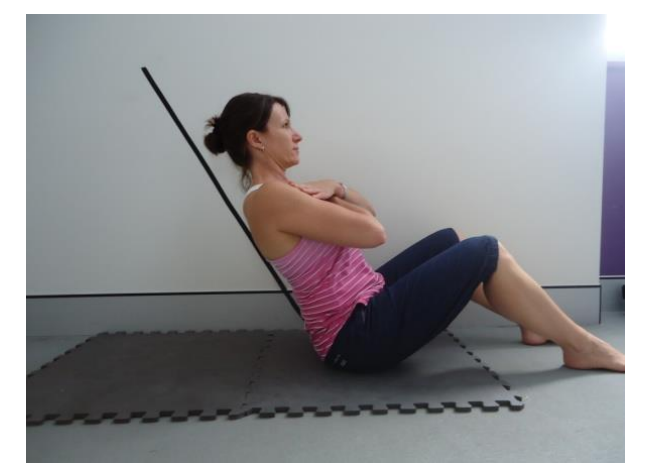
Figure S2.2 The flexor endurance test

60°. The test begins when the supporting wedge is removed and terminated when the subject could no longer maintain the upper body at 60°, with the length of the hold being recorded in seconds (18).