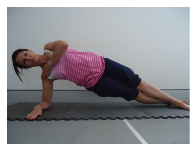
Figure S2.1 The side-bridge endurance test

This test was used to assess strength of quadratus lumborum and muscles of the anterolateral wall. The test was performed in accordance with McGill (14) with the lateral musculature tested with the subject lying in the full side bridge position. Feet are placed with the top foot in front of the lower foot for support with the legs extended. The participant supports themselves on their elbow and feet whilst lifting their hips from the floor to generate a straight body alignment from head to toe. The top arm is placed across the body with the hand resting on the supporting arm's shoulder. Failure arises when the subject loses the straight back posture and/or the hip touches the ground.