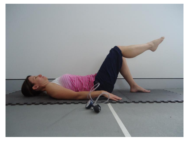
Figure S2.5 The Sahrmann test (level 1)

Level five: From the start position, the participant lowers both heels to 12 cm from the floor, the legs slide out to fully extend both knees, and then return to the start position (21).